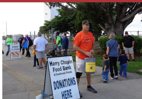
We are thankful for the 1,595 pounds of food and $1,746 in monetary gifts received from members of the community who attended Aviation Day Nov. 16 at Page Field Airport in Fort Myers.