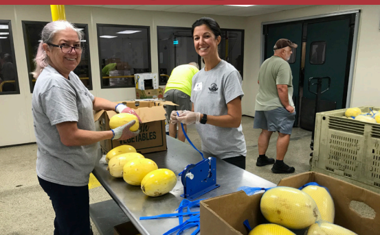
A group of our regular volunteers help sort and pack 8,250 pounds of spaghetti squash at our Fort Myers Distribution Center.