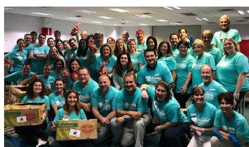
The 2020 Leadership Collier class gained a broad overview of how local human service agencies collaborate to effectively serve the growing needs of Collier County on Human Services Day at our Collier County Center.