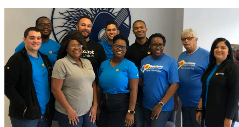
A group from Suncoast Credit Union packed 3,731 pounds of fresh produce at our Collier County Center.