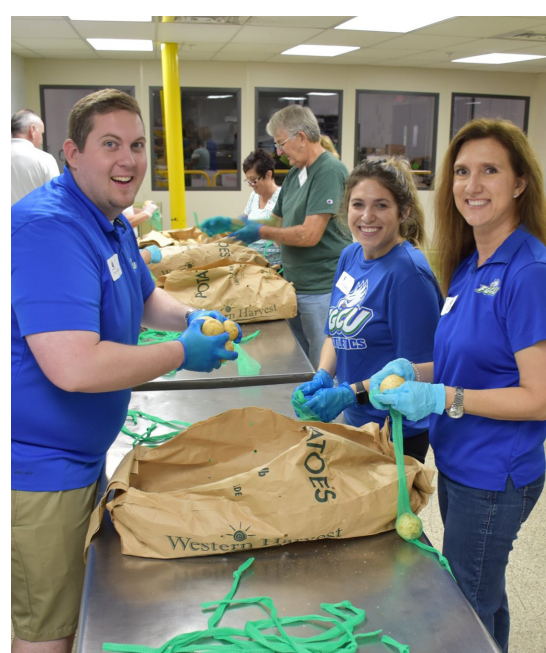
A group from Florida Gulf Coast University Athletics volunteered in our Fort Myers Distribution Center, helping the food bank pack 2,469 pounds of potatoes for our neighbors in need this Thanksgiving season.