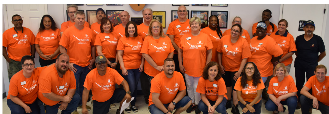
Harry Chapin Food Bank staff wore orange in support of Hunger Action Day, to help raise awareness of hunger in Southwest Florida and across the United States.