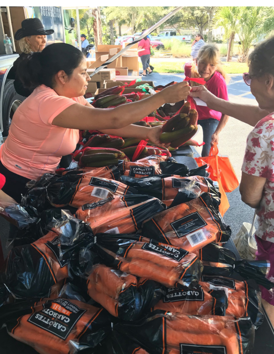
We served 211 families at our Fulfill Mobile Pantry held Nov. 8 at the Bonita Springs Lions Club.