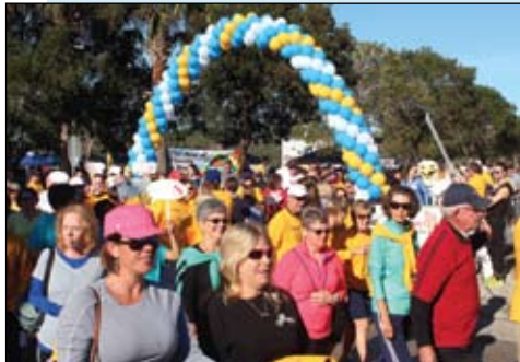
Supporters swarm the start of the 2016 WINK News Hunger Walk.

WINK News Feeds Families Hunger Walk is one of the highlights of the year for Southwest Florida, presenting sponsors Garden Street Companies and the Lee County Sheriff's Office, and the Harry Chapin Food Bank. Set your calendar for Jan. 21, 2017, and become a sponsor, form a team or just show up at Miramar Outlets to pledge your support! We raised $305,000 in 2016, so we need you...and you...and you! Visit harrychapinfoodbank.org and follow the link to the Hunger Walk.