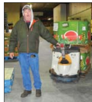
Continued on page 5